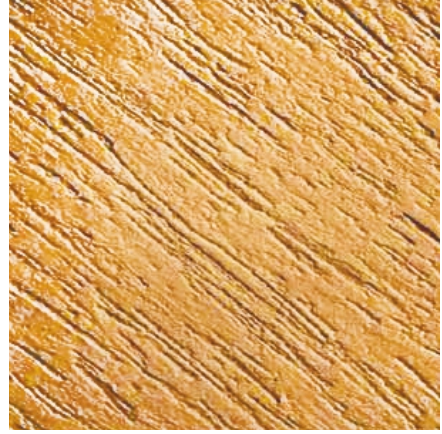
RUFF TUFF 2