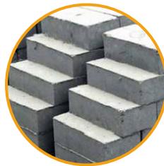
Fly Ash Bricks