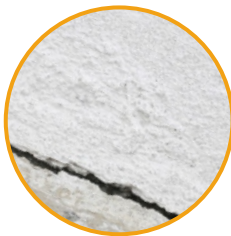
Horizontal & Vertical cracks