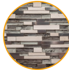
Glass Mosaic Tiles