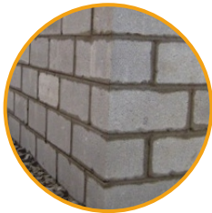
Brick & Block Work