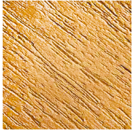
RUFF TUFF 2